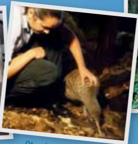
Otorohanga Kiwi House