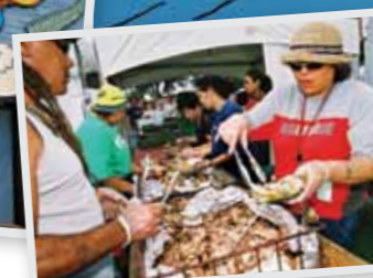
Kawhia Kai Festival