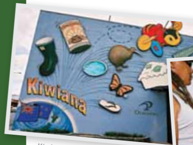
Kiwiana wall mural : Otorohanga