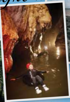
Black water rafting