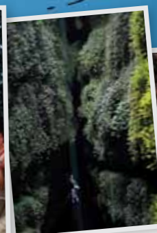
"Lost World" cave : Waitomo