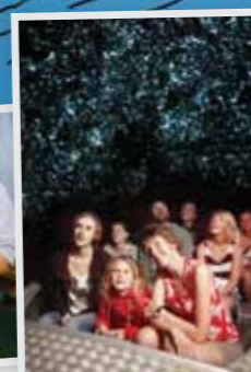
Glowworm cave : Waitomo