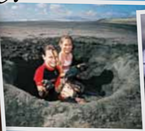
Te Puia Hot Springs : Kawhia