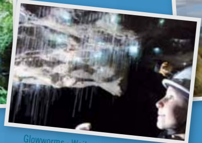
Glowworms : Waitomo Spellbound Cave