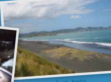
Ocean Beach : Kawhia