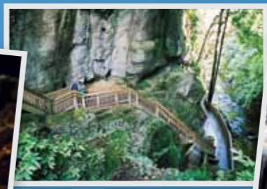
Mangapohue Natural Bridge