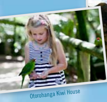
Otorohanga Kiwi House