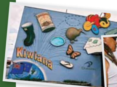
Kiwiana wall mural : Otorohanga