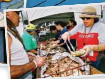
Kawhia Kai Festival