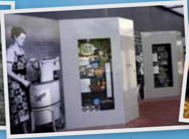
Ed Hillary Walkway : Otorohanga